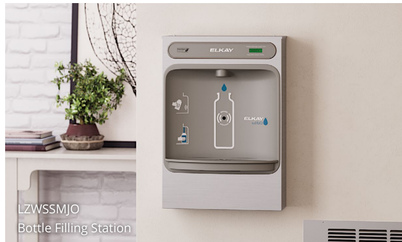
LZWSM82K Bottle Filling Station

Top: LZSTL8WSLP Bottle Filling Station with Single ADA Cooler; Bottom-left: LZWSM82K Bottle Filling Station In-Wall; Bottom-right: LBWDC00BKC Liv Pro Water Dispenser