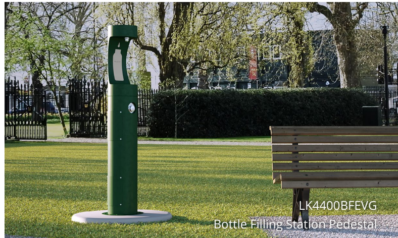
LK4400BFEVG Bottle Filling Station Pedestal