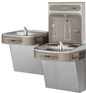
LZSTL8WSJOCX Modified with EZO Sensor Electronics on BOTH coolers+LZWSRJO